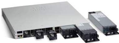
Figure 3. Cisco Catalyst 9200 Series switch dual redundant power supplies

Table 3 lists the PoE+ power availability for each model.