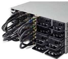
Figure 4. Cisco Catalyst 9200 Series switch stacked units