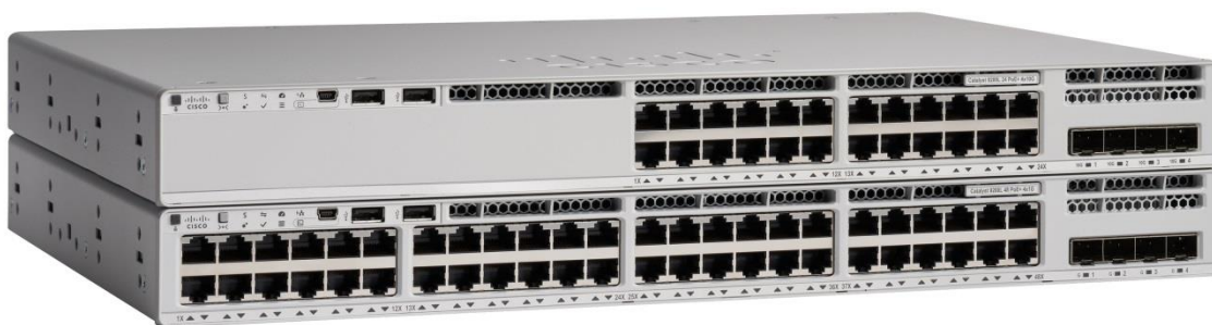
Table 1. Cisco Catalyst 9200 Series Switch configurations